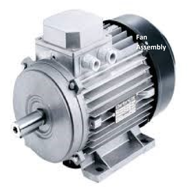
https://www.clarketooling.co.uk/product/clarke-1-5hp-single-phase-4-pole-motor/ Figure 1

Figure 2 shows the disassembled electric motor of Figure 1 with the rotor and stator assemblies exposed. Without component deviation, all electric motors have basically the same packaging of materials, such as structural material, electrical steel, copper windings, rare-earth permanent magnets ( RE-PM ), etc.